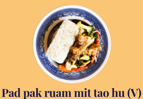
Stir fried mixed vegetables and tofu topped with crispy garlic