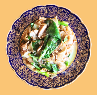
Pad see ew chicken $18.9 / veg $18.9 / beef $22.9 Thick flat noodles, stir fried with egg and Chinese broccoli