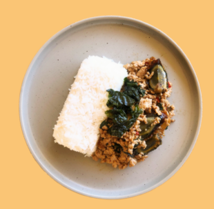
Pad kra pow 🥬 chicken $17.9 / crispy pork $24.9 Stir fried dried chilli and basil, onions, green beans (Thai style) Fried egg +$3