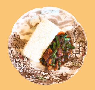
Pad prik gang 🎾 🥬 chicken $17.9 / crispy pork $24.9 Sitr fried Thai spicy curry with fresh green beans, peppercorns, fingerroot, bamboo, capsicum