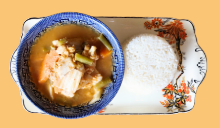
Sour curry barramundi 🥬 $22.9

Thai spicy red curry, green beans, bamboo, capsicum, pumpkin & basil